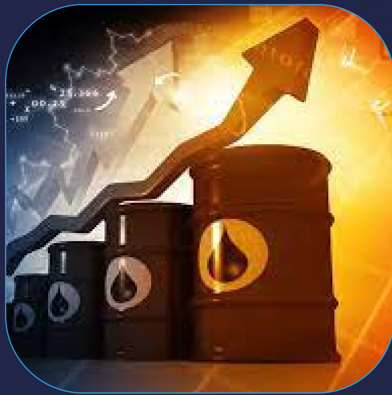
Oil Trading (Import & Export)