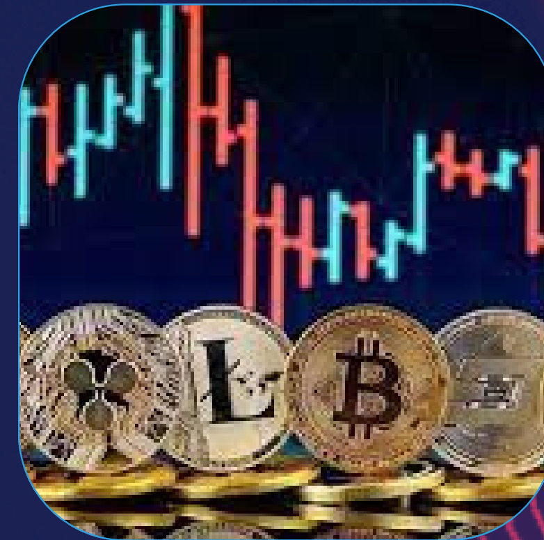
Crypto Trading & Blockchain